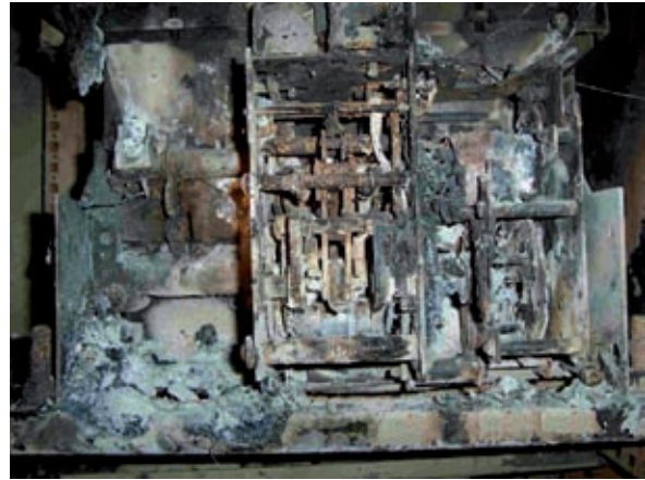
Fig. 3: Power switch of a 1 MW wind turbine – destroyed by fire

A low-voltage switchgear was installed within the nacelle of a 1 MW wind turbine. The bolted connection at one of the input contacts of the low-voltage power switch was not sufficiently tightened. The high contact resistance resulted in a significant temperature increase at the junction and in the ignition of adjacent combustible material in the switchgear cabinet. The fuses situated in front did not respond until the thermal damages by the fire were very severe. Control, inverter and switchgear cabinets that were arranged next to each other suffered a total loss. The interior of the nacelle was full of soot. Despite the enormous heat in the area of the seat of fire, the fire was unable to spread across the metal nacelle casing. The damage to property amounted to EUR 500,000.