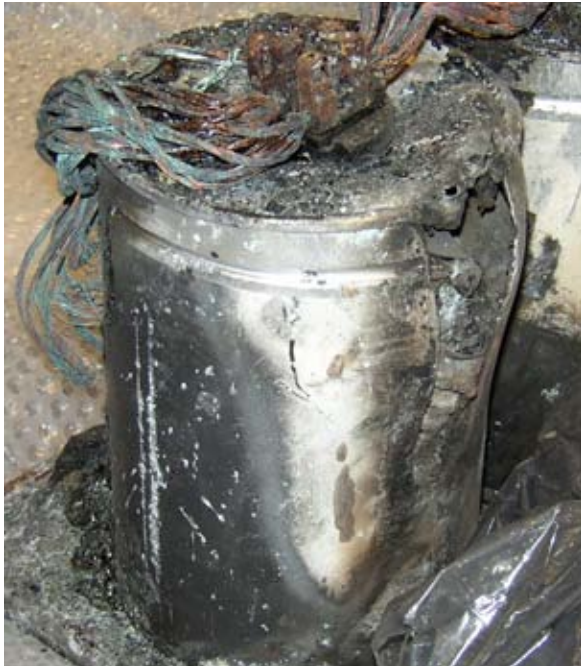
Fig. 4: Burst pressure vessel of a line filter capacitor