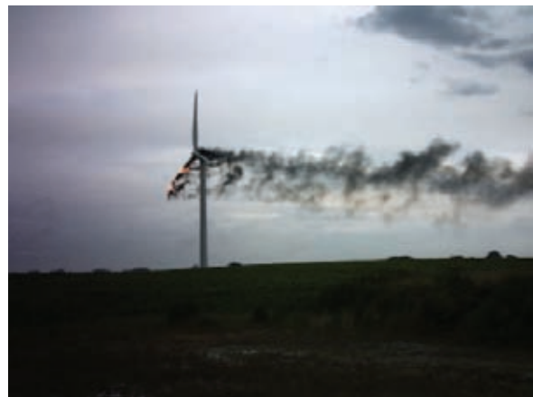
Fig. 1: Fire after lightning struck a 2 MW wind turbine in 2004

connection of the lightning protection system that was not correctly fixed. The electric arc between the arrester cable and the connection point led to fusion at the cable lug and to the ignition of residues of hydraulic oil in the rotor blades.