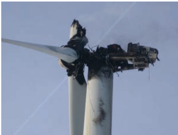
Fig. 2: Burnt down nacelle of a 1.5 MW wind turbine

The nacelle of a 1.5 MW wind turbine completely burned out after the slip ring fan of the doubled induction generator had broken. Sparks that were generated by the rotating fan impeller first set the filter pad of the filter cabinet on fire and then the hood insulation. The damage to property amounted to EUR 800,000.